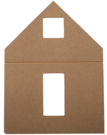
Right Side Wall w/ 2 Window Openings & Peak