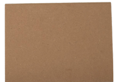
Roof (front & back same)