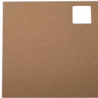
Upper Second Floor