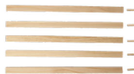
Porch Posts & Small Dowels