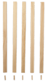
Porch Roof Supports

Push the Small Wood Dowels into the holes on the bottom end of Square Porch Posts. Install each Porch Post into the holes on the Base and glue in square notches above on Porch Ceiling. (This includes the notch on the corner.)