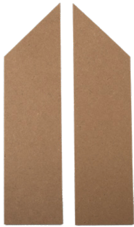
Porch Roof Sides