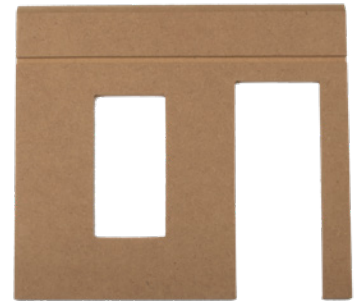
Front Wall w/Door and Window Opening