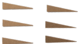
Porch Roof Support (wedge)